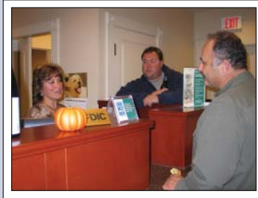
Teller window became a natural arrangement for the bar.