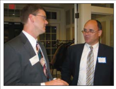
Plenty of networking could be seen.

Attendees enjoyed an excellent networking environment, a variety of tasty dishes and tellers' cages which served as the bar. Huge baskets of goodies were won by lucky winners of the door prize drawings (pictured on pg 9).