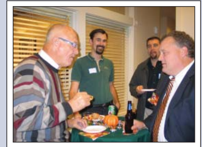
A good time was had by all who attended.